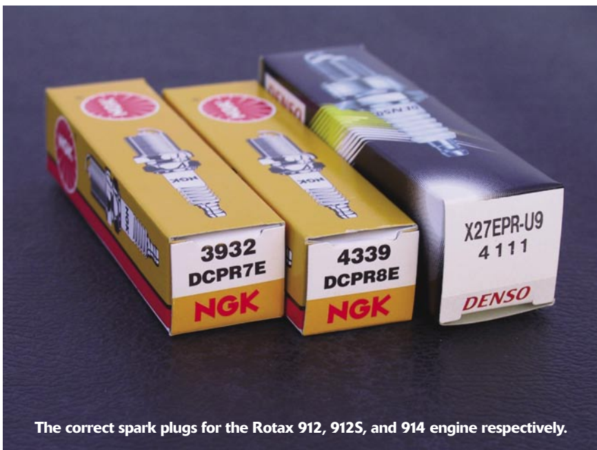
The correct spark plugs for the Rotax 912, 912S, and 914 engine respectively.

A. I have heard of builders using that four-cylinder magneto and doing several workarounds. Here's how the two-cylinder